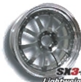
SK3-R Lightweight Competition Wheel